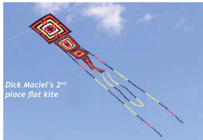
Dick Maciel's 2 nd place flat kite

I use 3M's 9460 VHB tape. I've tried the various dressmaker's tape available at fabric stores, but none hold up to the stresses of kites. Same with double sided cellophane tape like Scotch brand.